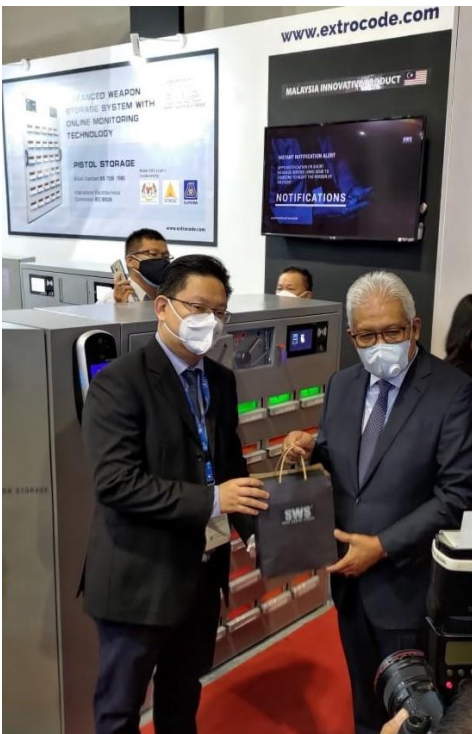
Mr. Brian Lew presents souvenir to Home Minister Datuk Seri Hamzah Zainudin

On the recent 17th Defence Services Asia (DSA2022) show held in Malaysia International Trade and Exhibition Centre (MITEC), Kuala Lumpur from 28-31 March 2022, Smart Weapon Storage range of product showcase the upgrade of enhance biometric authentication technologies from IDEMIA France, featuring the state of art frictionless technologies with contactless fingerprint scanner MorphoWave Compact and award winning facial recognition terminal VisionPass in allowing user to have a seamless experience in using the intelligence weapon storage with enhanced security technologies.