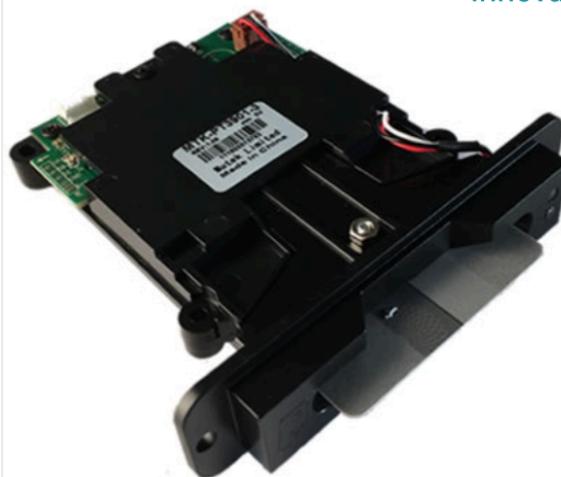
Full Insert Model