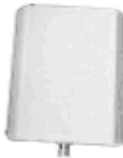
type C 7.15dBi antenna