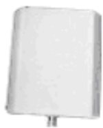
7.5 Dbi Antenna