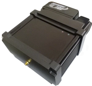
E500 Bluetooth Reader