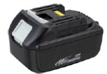
3AH Li-ion Battery