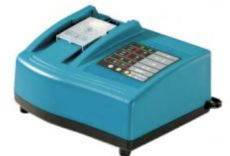
Desktop Battery Charger